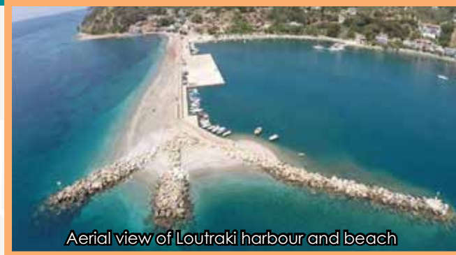
Aerial view of Loutraki harbour and beach