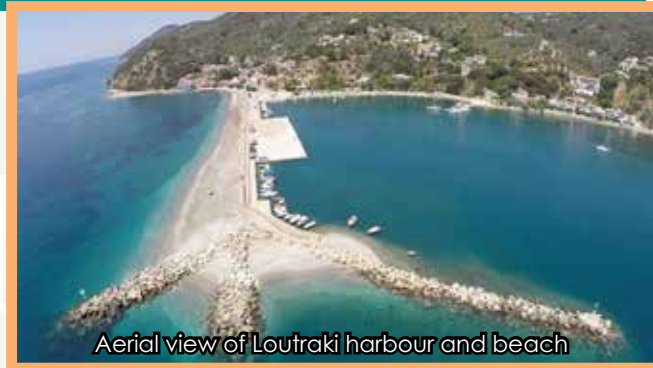
Aerial view of Loutraki harbour and beach